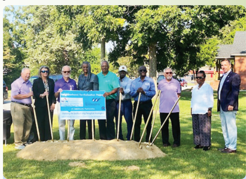
Neighborhood Revitalization Program (NRP) Groundbreaking September 2022, to represent the partnership between the City of Washington & Washington Housing Nonprofit Inc's WISH Program.

Applicants to NRP must be current residents in the City of Washington, residents of Beaufort County, or residents of Low-Income Public Housing (LIPH) properties owned and managed by the Washington Housing Authority (WHA), participating the Housing Choice Voucher (HCV) Program through WHA, or currently residing in Clifton Meadows, a USDA property owned and managed by Washington Housing Nonprofit Inc (WHNI). General eligibility requirements are featured on the WHA website.